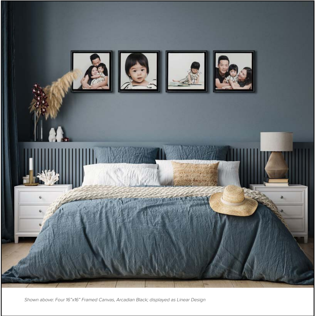
Shown above: Four 16"x16" Framed Canvas, Arcadian Black; displayed as Linear Design