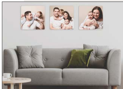
(Shown above - Medium Linear Wood Panel 16"/16"/16")

Our most popular styles are made to work in any home. Save up to 15% when ordering a designer collection.