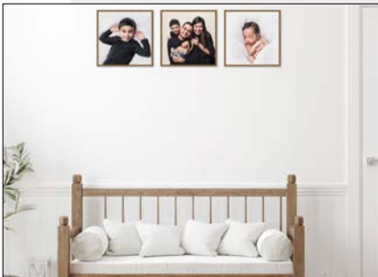
(Shown above - Large Linear Framed Stone 12"/12"/12")

Our most popular styles are made to work in any home. Save 15% or more when ordering a designer collection.