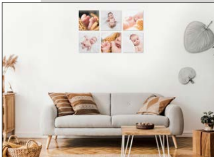
(Shown above - 6-piece canvas cluster 10"/10"/10"/10"/10"/10")

Our most popular styles are made to work in any home. Save up to 15% when ordering a designer collection.