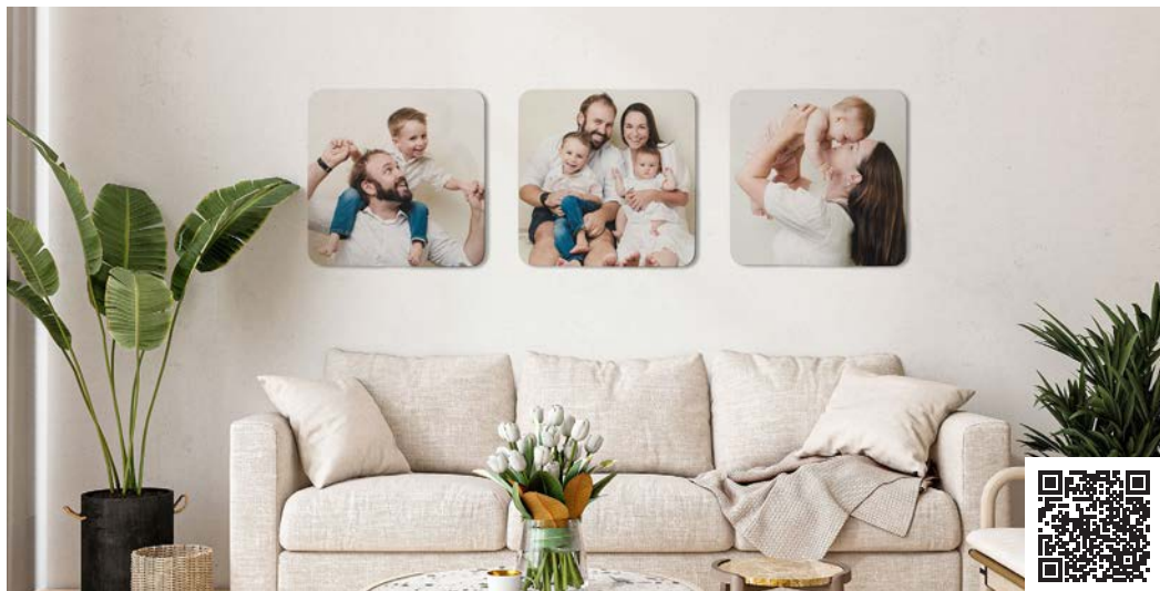
(shown above - Linear Large Wood Panel collection (20"x20"))