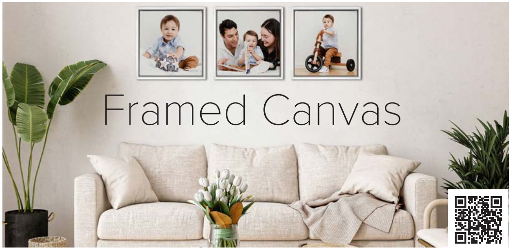
(shown above - Linear large framed canvas in Hampton White.

Enhance your wall art with a handmade timber frame that adds warmth, texture and a floating effect. Ideal for a natural and rustic touch to your home décor, or to complement your current or future design.