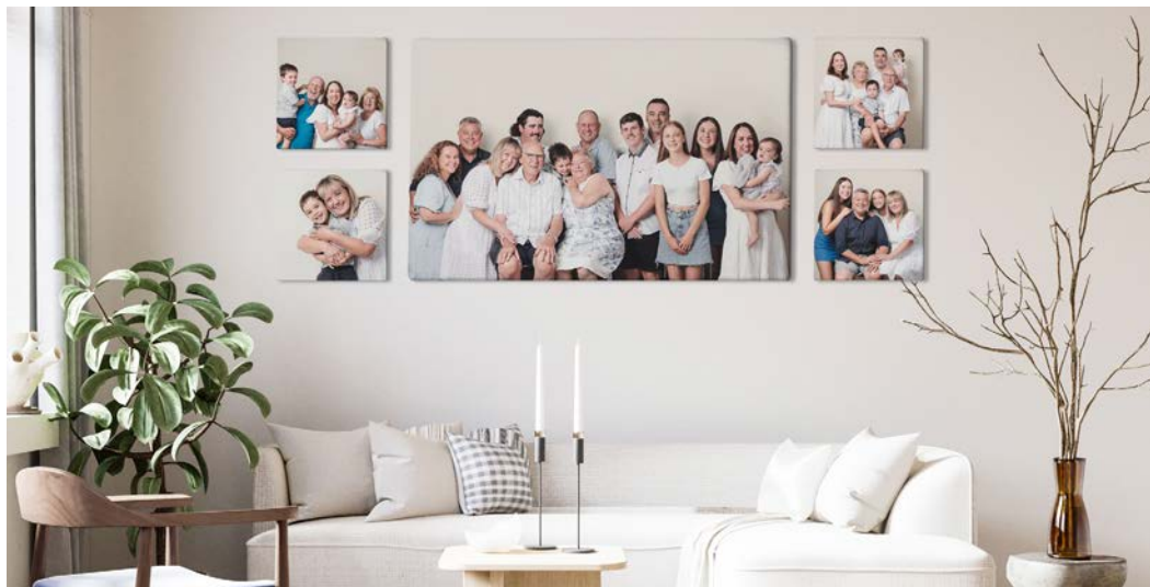
(shown above - Cluster 4-piece (14"x14") with added centre piece (30"x40" feature).