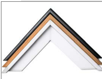
(Shown above - three finishes available)

Our most popular styles are made to work in any home. Save 15% or more when ordering a designer collection.