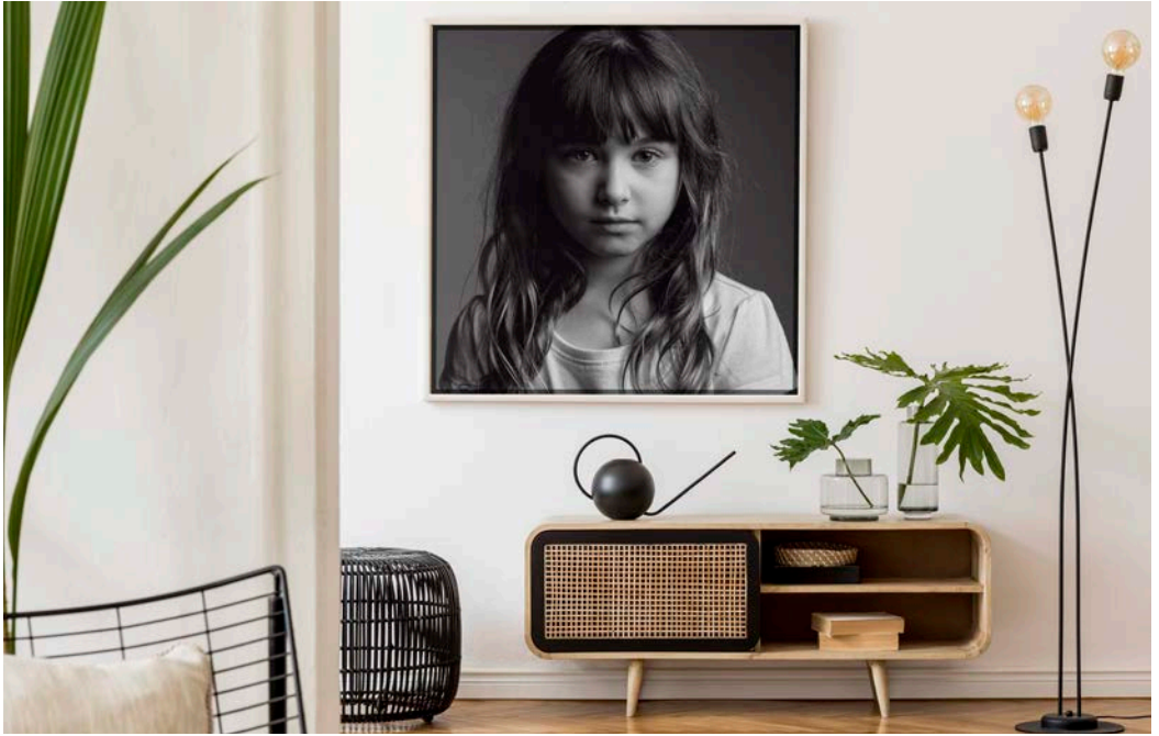
(shown above - 30"x30" framed canvas with natural oak)